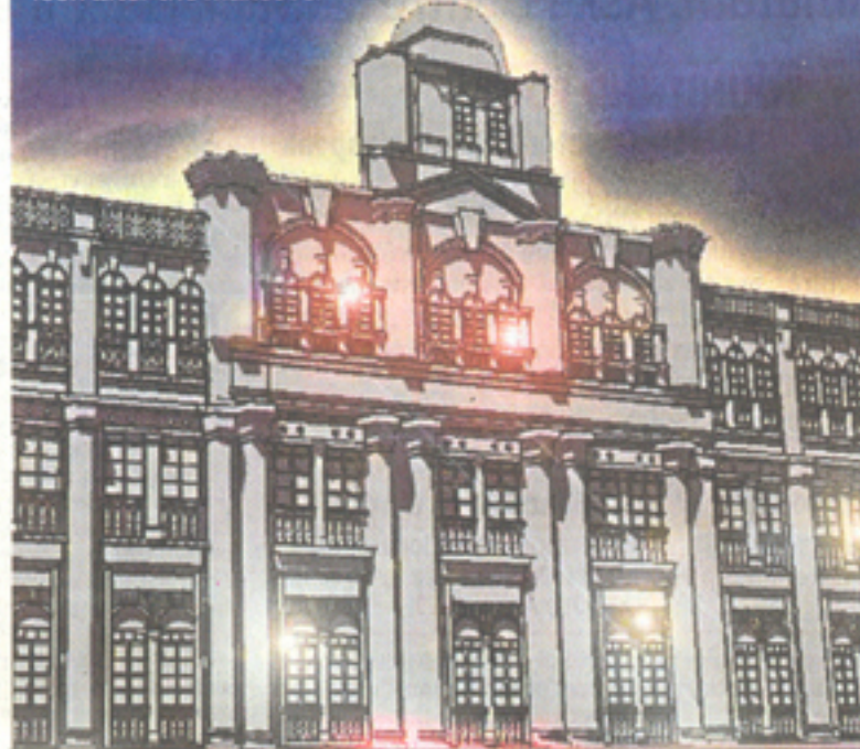
Repair work has already started

An artist's impression of how Park Mansions will look after the makeover