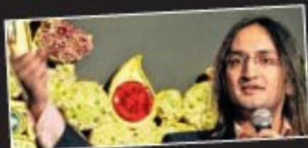
Funnyman Papa CJ had everyone including Mani Shankar Aiyar in splits